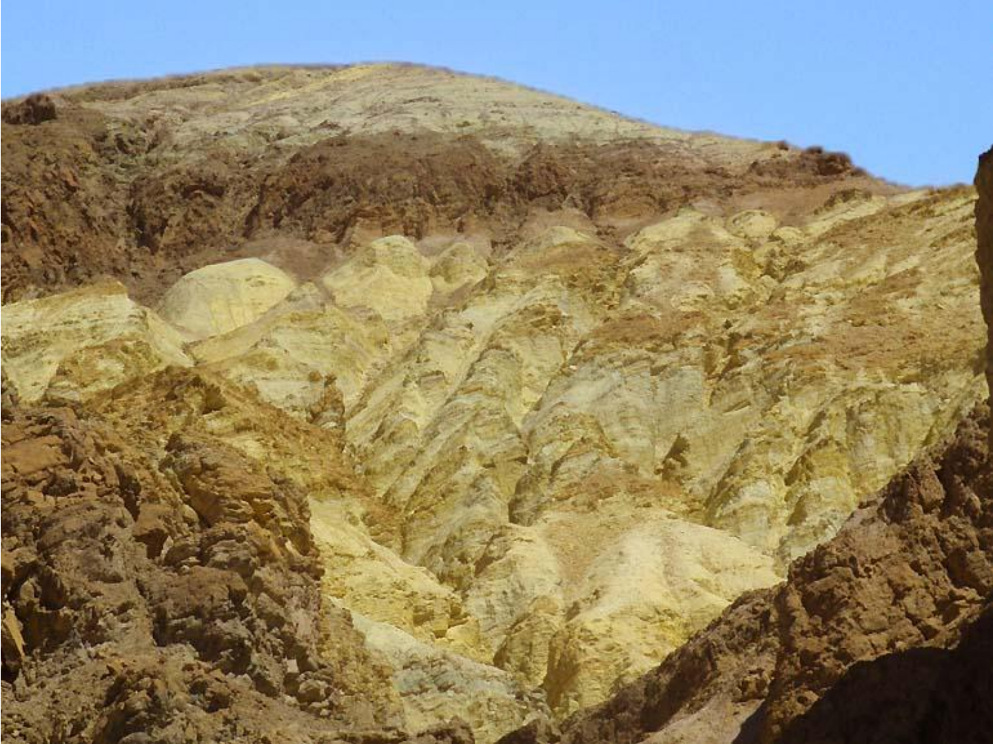
These are the hills just as you enter Gold Canyon.