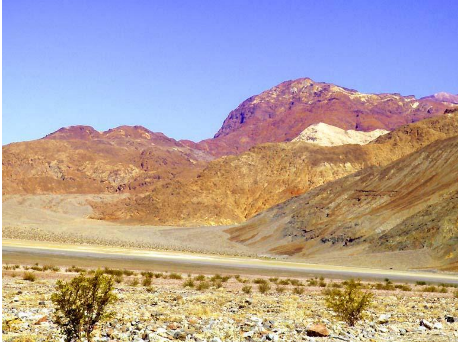
Some colorful mountains on the north part of the park as one drives to Scotty's Castle.