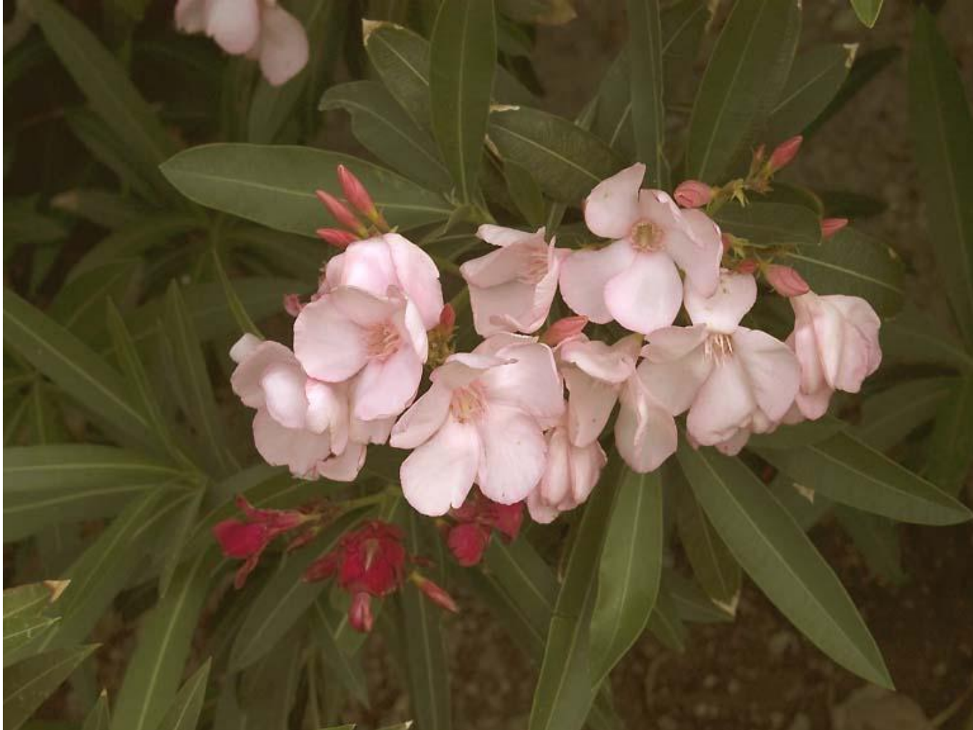
More flowers in Saline Valley.