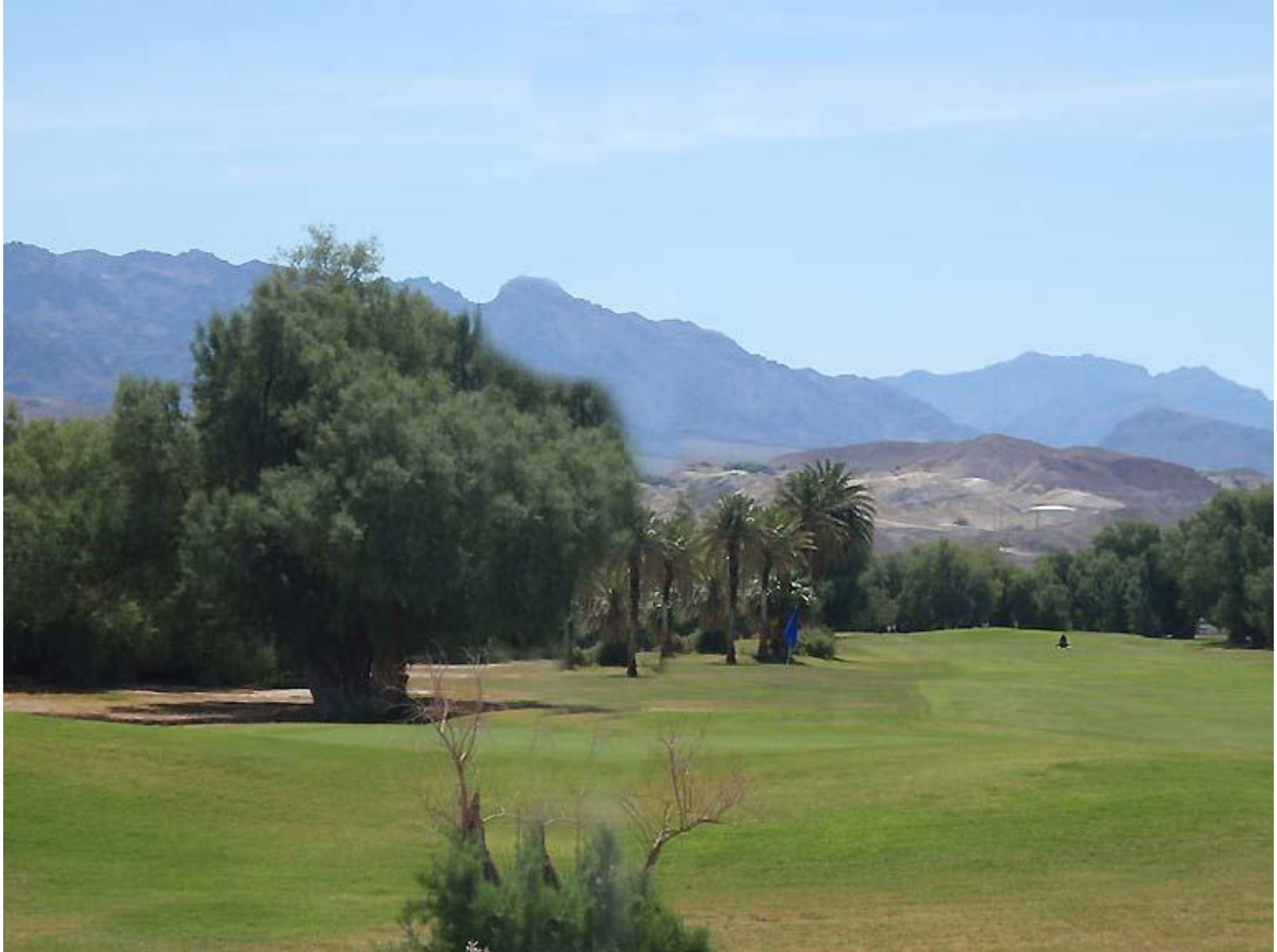
A shot of the Seventh Green and Eighth Fairway on the course. It is in very good shape as you can see.