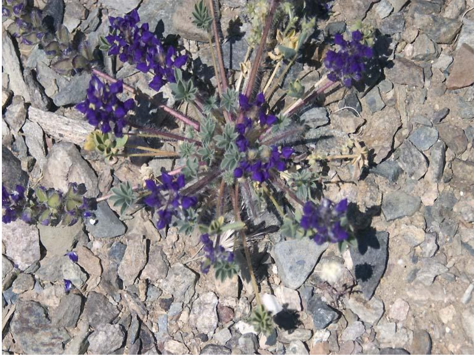
Some flowers up Saline Valley. I visited a bit late, and most of the flowers were gone.