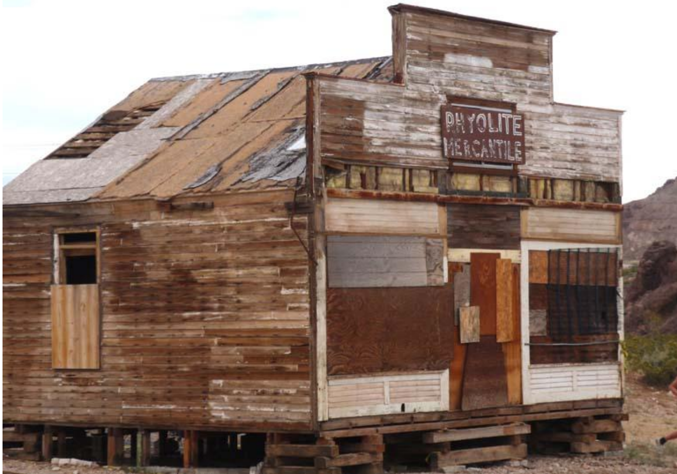
This is the general store in a ghost town in the northern part of the park.